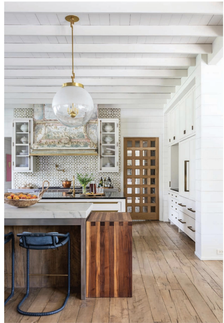
THIS KITCHEN HAS A DASH OF EVERYTHING, VINTAGE FINDS, LUXE MATERIALS, CUSTOM MILLWORK AND PLENTY OF UPCYCLED WOOD WITH GRAINS THAT TELL A STORY.