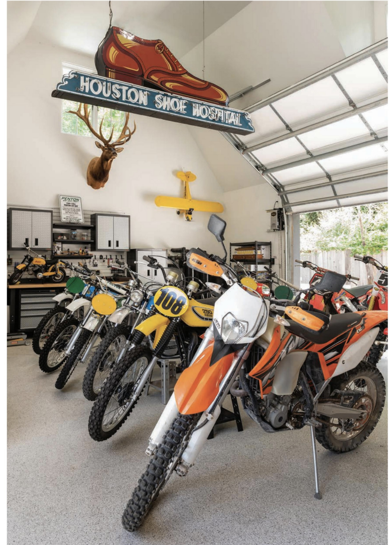
AS AN AVID HUNTER AND MOTORCYCLE ENTHUSIAST, THE HUSBAND REQUESTED A DEDICATED SPACE WITHIN THE GARAGE TO SERVE AS HIS MAN-CAVE.