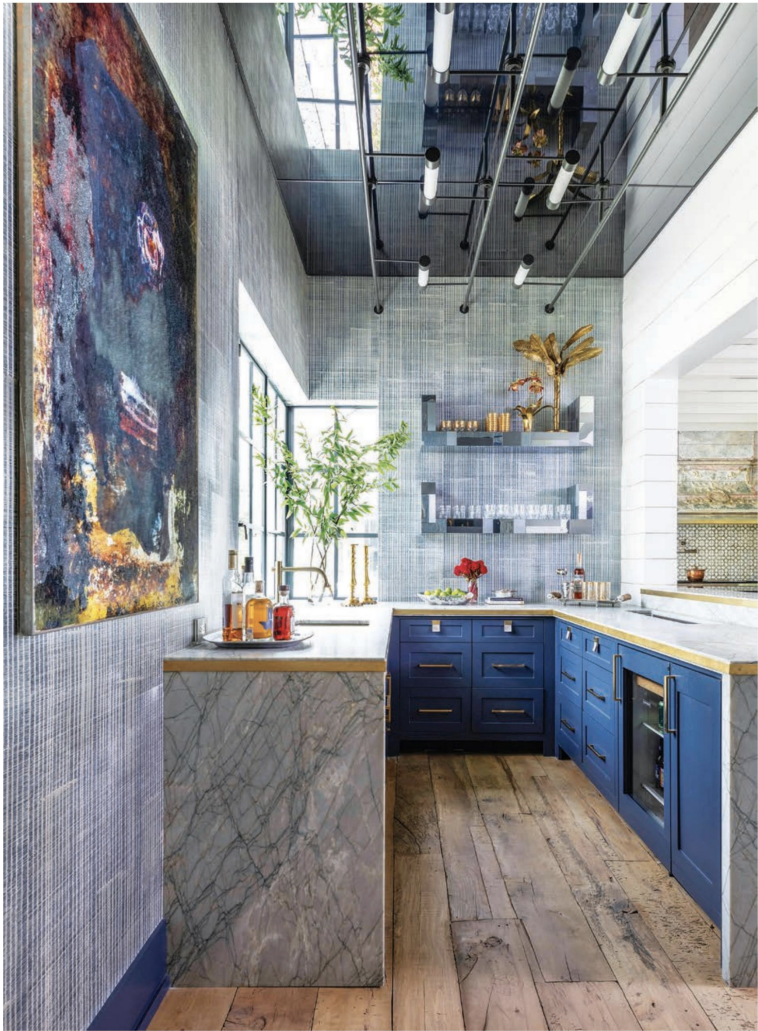
THE HOMEOWNERS LOVINGLY REFER TO THIS ALCOVE AS THE WHISKEY BAR, STOCKED AND PREPPED FOR GUESTS AND/OR A BASH, FEATURING A TOWERING WINE UNIT AND CRATES OF WHISKEY HIDDEN AWAY IN THE DRAWERS. A CUSTOM, RECTANGULAR ICE BUCKET IS CUT INTO THE COUNTERTOP TO KEEP BOTTLES OF CHAMPAGNE CHILLED AND READY TO IMBIBE, WHILE THE LIGHT FIXTURE WAS CUSTOM BUILT BASED ON A PHOTOGRAPH THE CLIENT FOUND OF AN OLD BAUHAUS PROJECT.