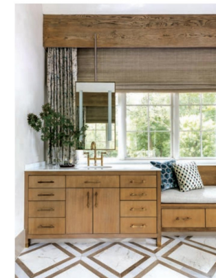
INSIDE THE PRIMARY BATHROOM, THE VANITY'S NATURAL WOOD TONES ARE TOPPED WITH SLABS OF WHITE MARBLE AND ACCENTUATED WITH THE WHITE-AND-GOLD-TILED FLOOR.

The altar is flanked by white custom cabinets with glass panels and brass finishes on either side to complete a sense of flow and cohesion. Another dazzling antique find is the hardwood flooring throughout the kitchen, with the few leftover panels repurposed in the upstairs wet bar, while several other varieties and shades of vintage wood grace the home to deliver bespoke, artisanal details.